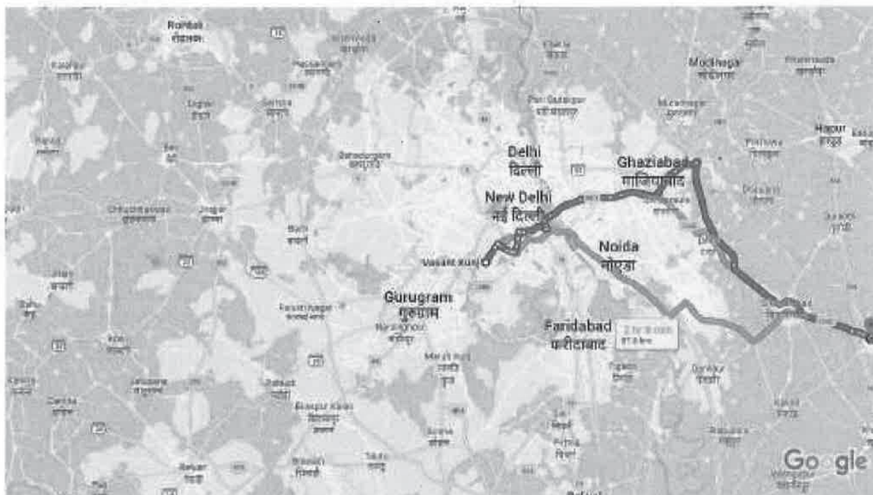
Map data ©2024 10 km

Google Maps Vasant Kunj, New Delhi, Delhi to Hotel Natraj, Kale Drive 101 km, Aam, Delhi Rd, Civil Lines, Bulandshahr, Uttar Pradesh 203001